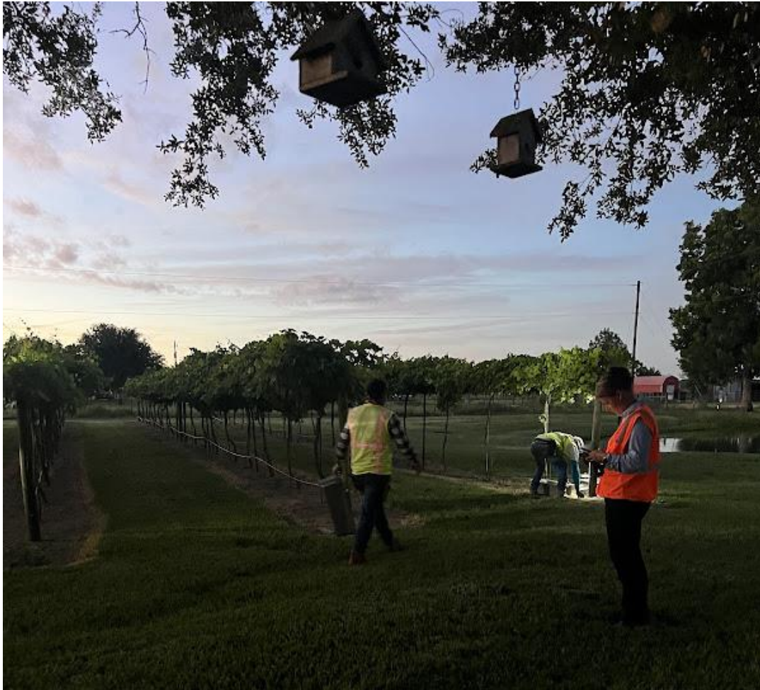
2024 Fleming Farms Vineyards