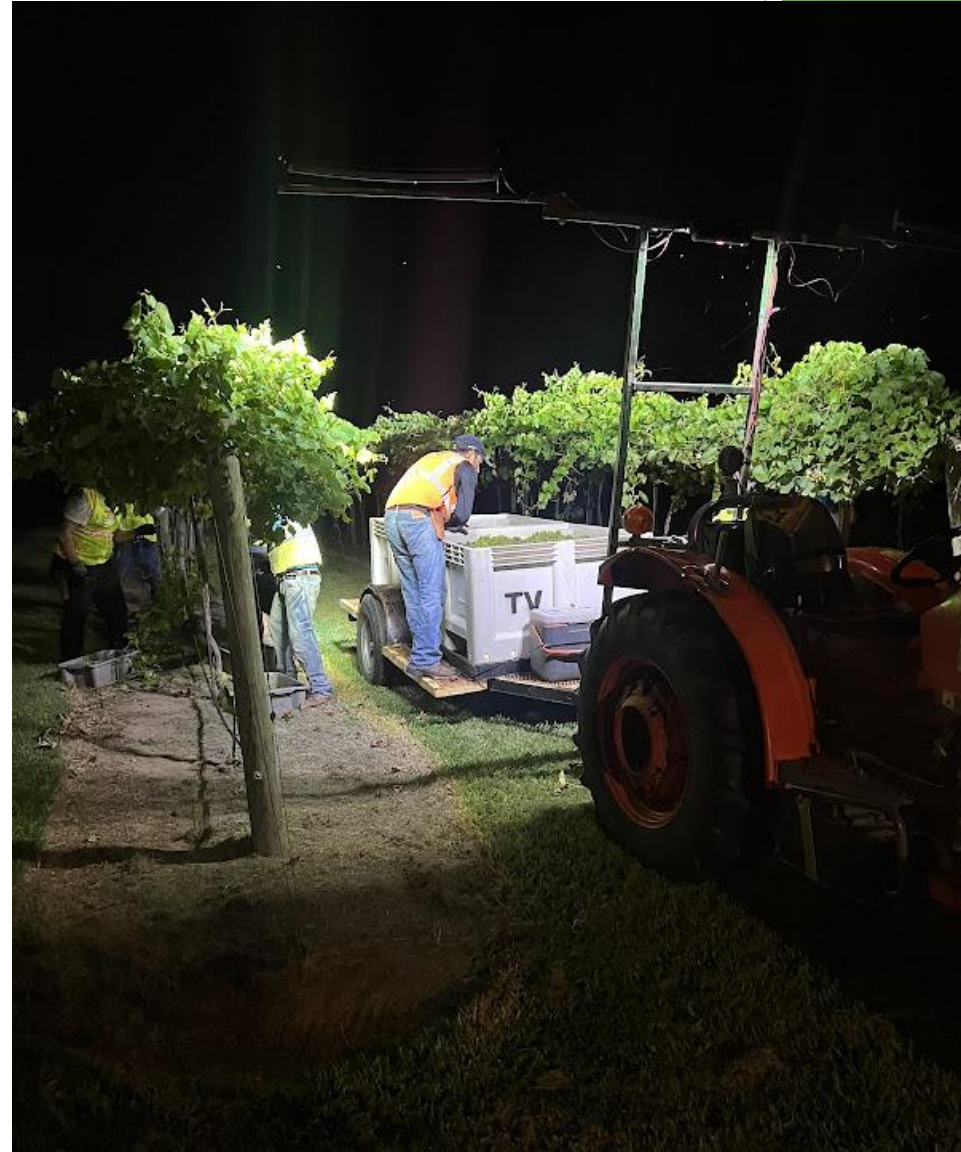
2024 Fleming Farms Vineyards