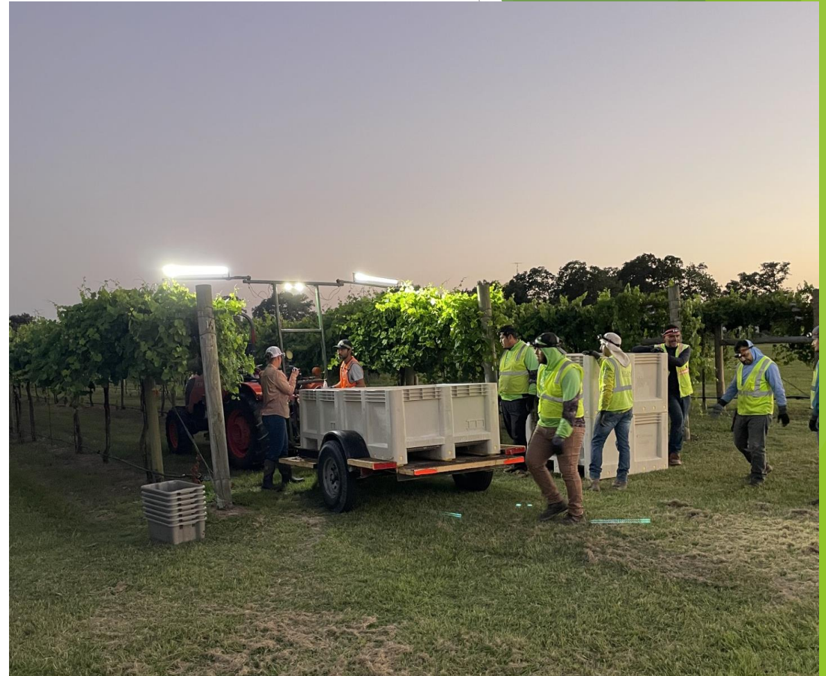
2024 Cummins Creek Vineyard