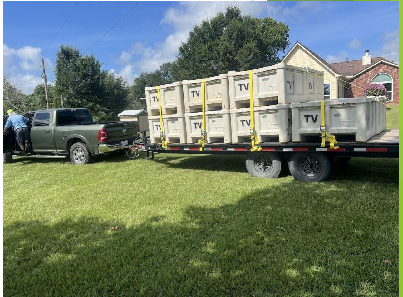
2024 Fleming Farms Vineyards