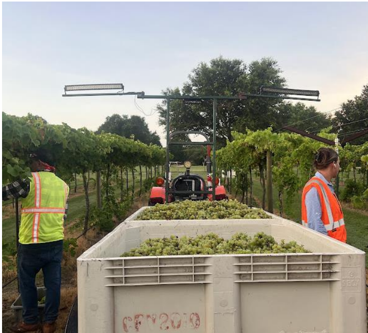
2024 Fleming Farms Vineyards