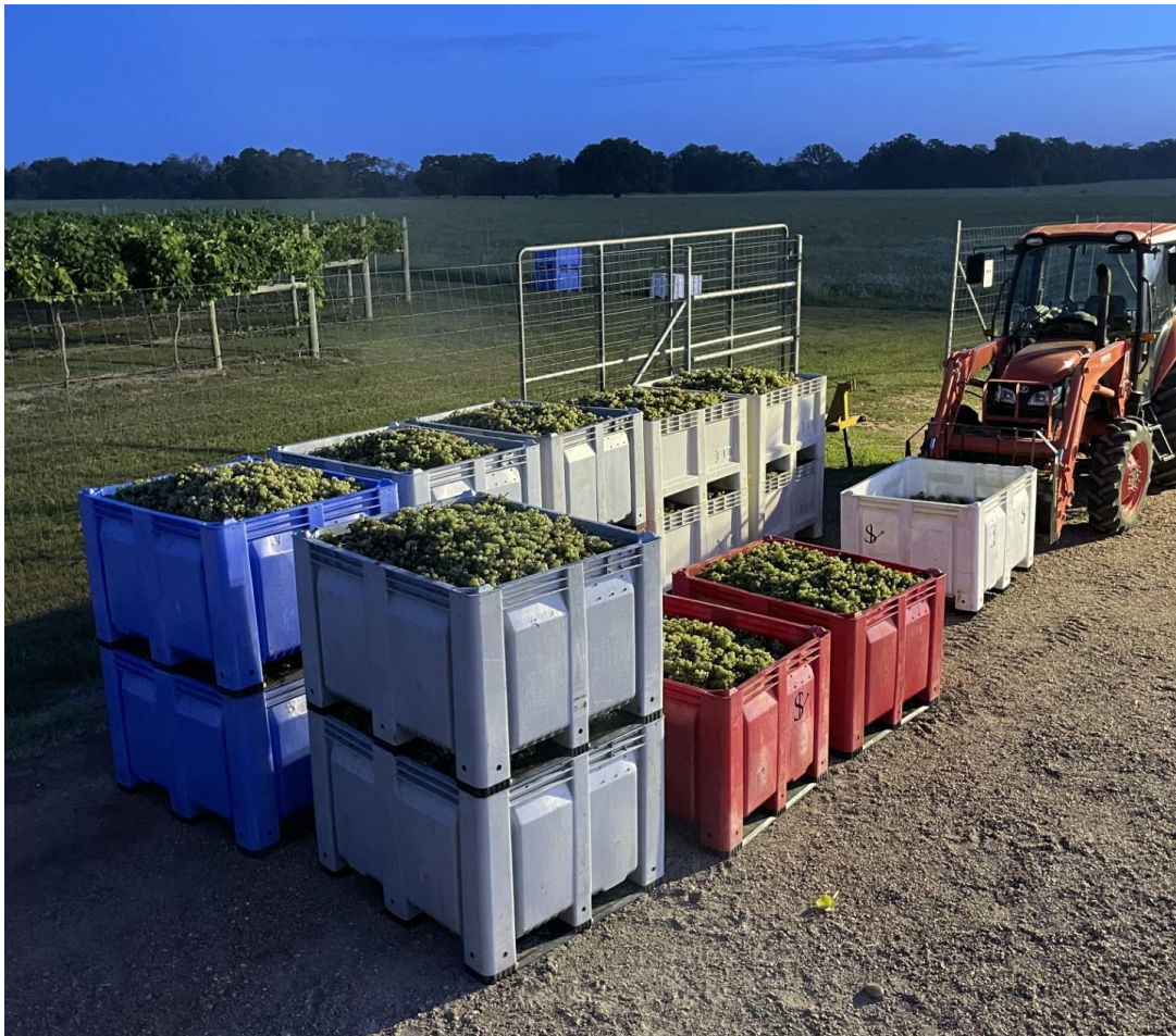
2024 Cummins Creek Vineyard